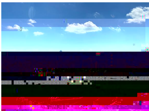
The view from his office window, looking out over the Ginza shopping district and Marunouchi in Tokyo.